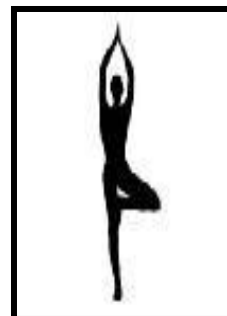
New Morning Workouts

A booking system for all classes is maintained at reception. We would urge all our members to book for all classes in order to reserve a position.